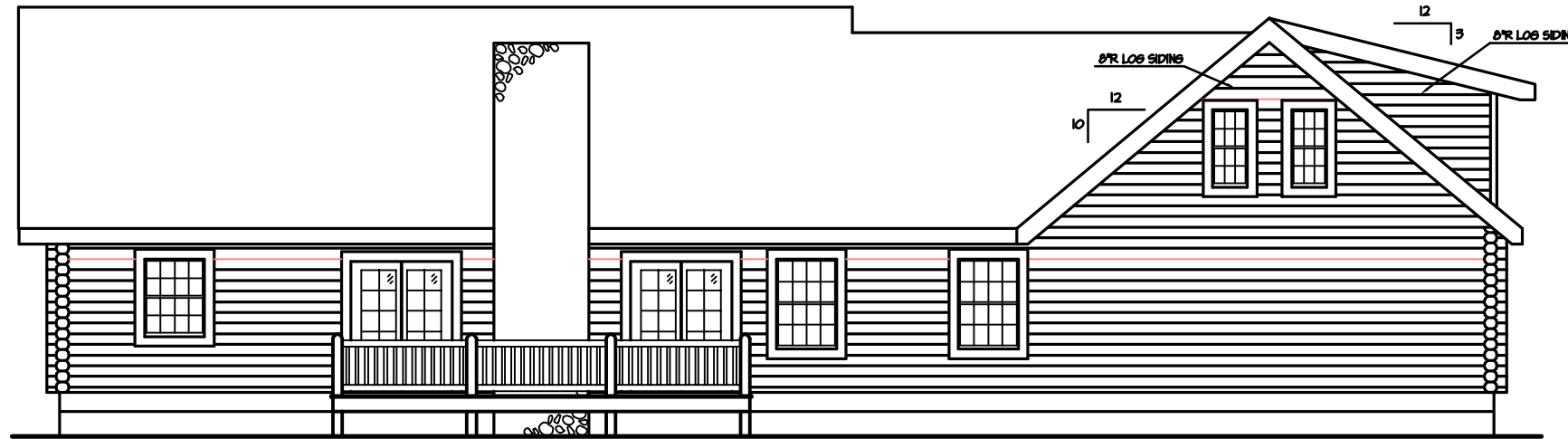
REAR ELEVATION 1/4" = 1'-0"